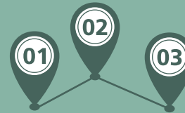
Chart Your Course